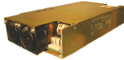
Low profile: 212.5 x 116 x 43mm